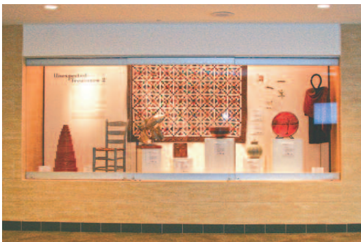
ART CASE – Two identical cases available.