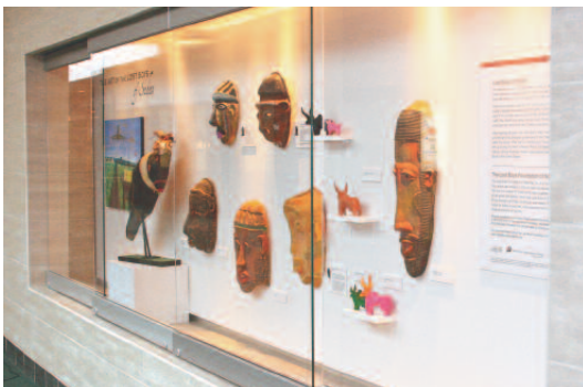
COMMUNITY ART SPACE