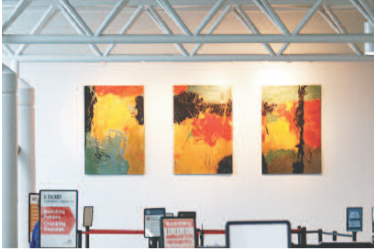
TICKETING LOBBY – Two exhibit walls available.