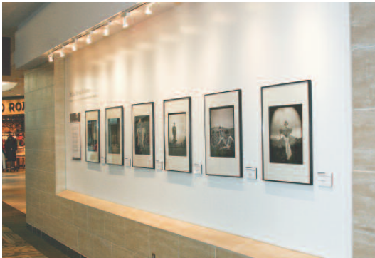
CONCOURSE C ART WALL